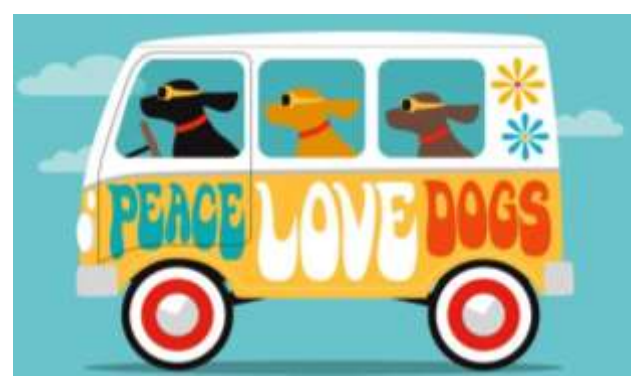
RV Camping on site

A very limited (4 spots) amount of space is available for RV's at the trial site. There are no hook ups or water available. These spots will be allocated on a first come first serve basis so please email the trial secretary to reserve a spot as soon as possible. speeddogcoursing@gmail.com